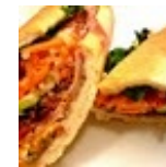
Hungry on a Fiver: Top 10 East Village Eats for $5-ish