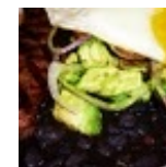
El Cobre's Hot Cuban Brunch