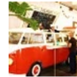
Fonda Nolita Heats Up Taco Truck Wars