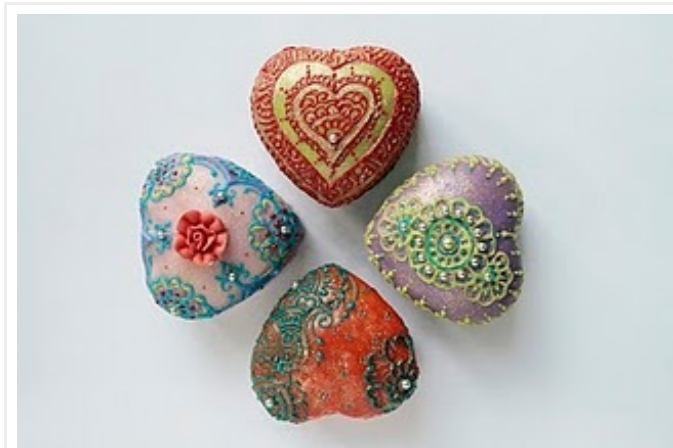
Capture her heart with these gems

designed cakes is South Asian weddings (wedding cakes are still a Western concept, but increasingly more common in modern Indian weddings), it's only a matter of time before these inspired, one-of-a-kind creations are all the rage. Not to mention the bejeweled cupcakes. Did you hear that, Magnolia Bakery?