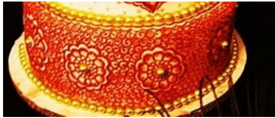
Too pretty to eat

consistency of the ink, a blend of edible dyes and powdered sugar, perfect.