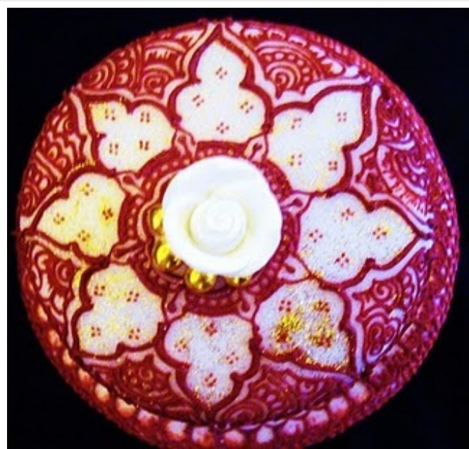
Exquisite freehand detailing

These cakes are beyond stunning. If only President Obama had presented one when he hosted the Prime Minister of India for dinner at the White House. Talk about show stopper.