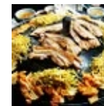
The Ultimate Pig Out