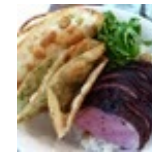
Momofuku's Duck Bar Extraordinaire